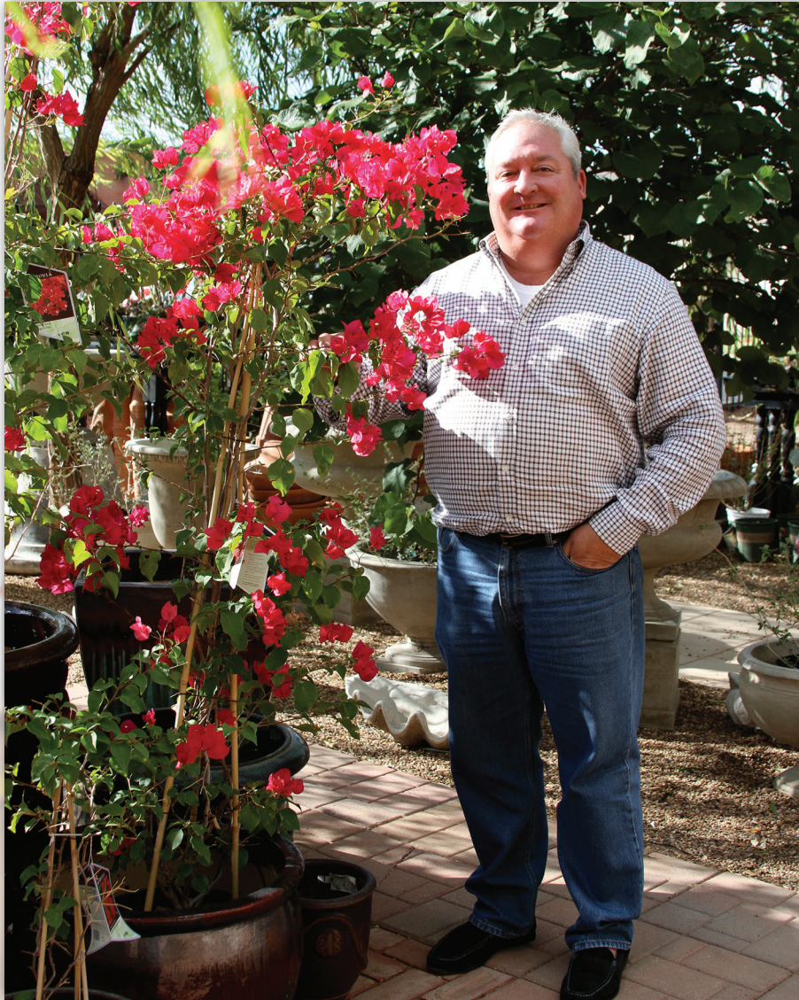
Marble enjoying a beautiful day at The Gates at College Flowers, which opened in April of 2011.

Special events, such as the Vision and Tradition Campaign Celebration Gala, are what set College Flowers apart from ordinary flower shops. Due to competition in mass markets, Marble said flower shops must find a niche, such as special events and weddings, in order to be successful.